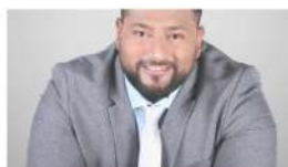
CS Event’s 3rd Digital Health MENA taking place on June 7to focus on US$252 bn