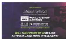
The Private Office of Sheikh Saeed Bin Ahmed Al Maktoum joins World AI Show & Awards