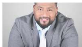
CS Event’s 2nd ME Data Analytics Forum on June 22, to focus on US$215 billion